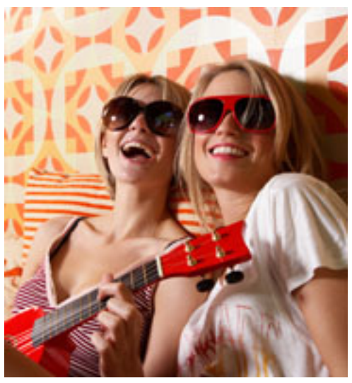
Surrounding yourself with happy people is healthy!

What's one way to get happy? Pamper yourself! Exposure to stress, a contributing factor to unhappiness, over a long period of time can increase the rate of neural degeneration and increase the risk for Alzheimer's disease. Luckily, a study from Umea University in Sweden has shown that just five minutes of massage has the potential to lower stress, and 80 minutes of massage has a tremendously positive effect on stress levels. Get pampered, get happy, and cheer up your friends and family!